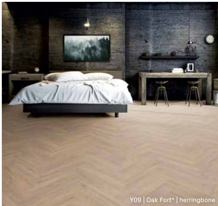
Y09 | Oak Fort* | herringbone