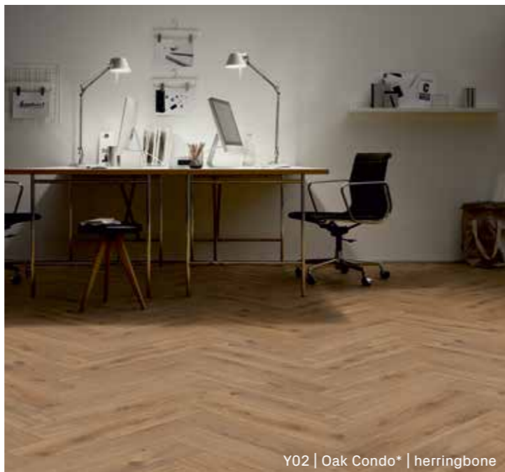
Y02 | Oak Condo* | herringbone

Y02 1101021803 | 665x133x10 mm | herringbone